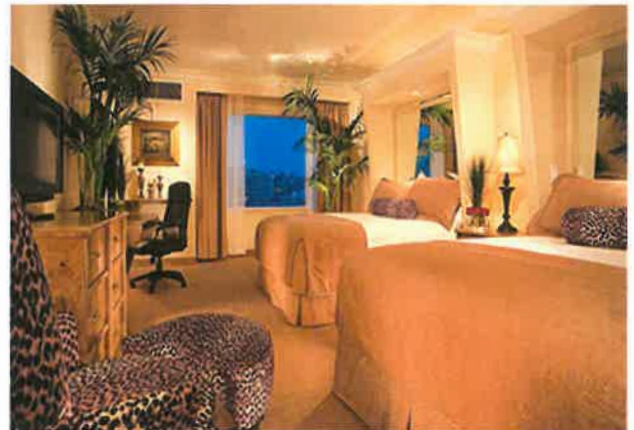
Davenport Tower Hotel Deluxe Double Queen Guest Room

The Historic Davenport Hotel & Tower is offering a special room block and you just need to mention the 2017 WSWRA Annual Conference as the group you are with to receive this special room rate.