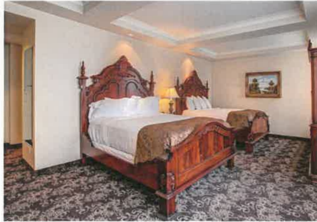
Historic Davenport Hotel Deluxe Double Queen Guest Room